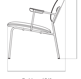
D: 66 cm / 26"