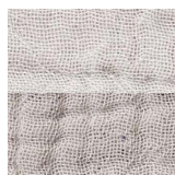
→ Cloud & Milk