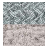
→ Cloud & Sage