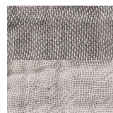
→ Cloud & Slate