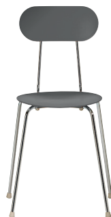
Matt colour Grey Anthracite 1420 C