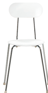
Matt colour White 1700 C