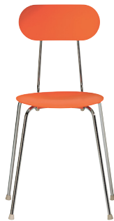
Matt colour Orange 1085 C