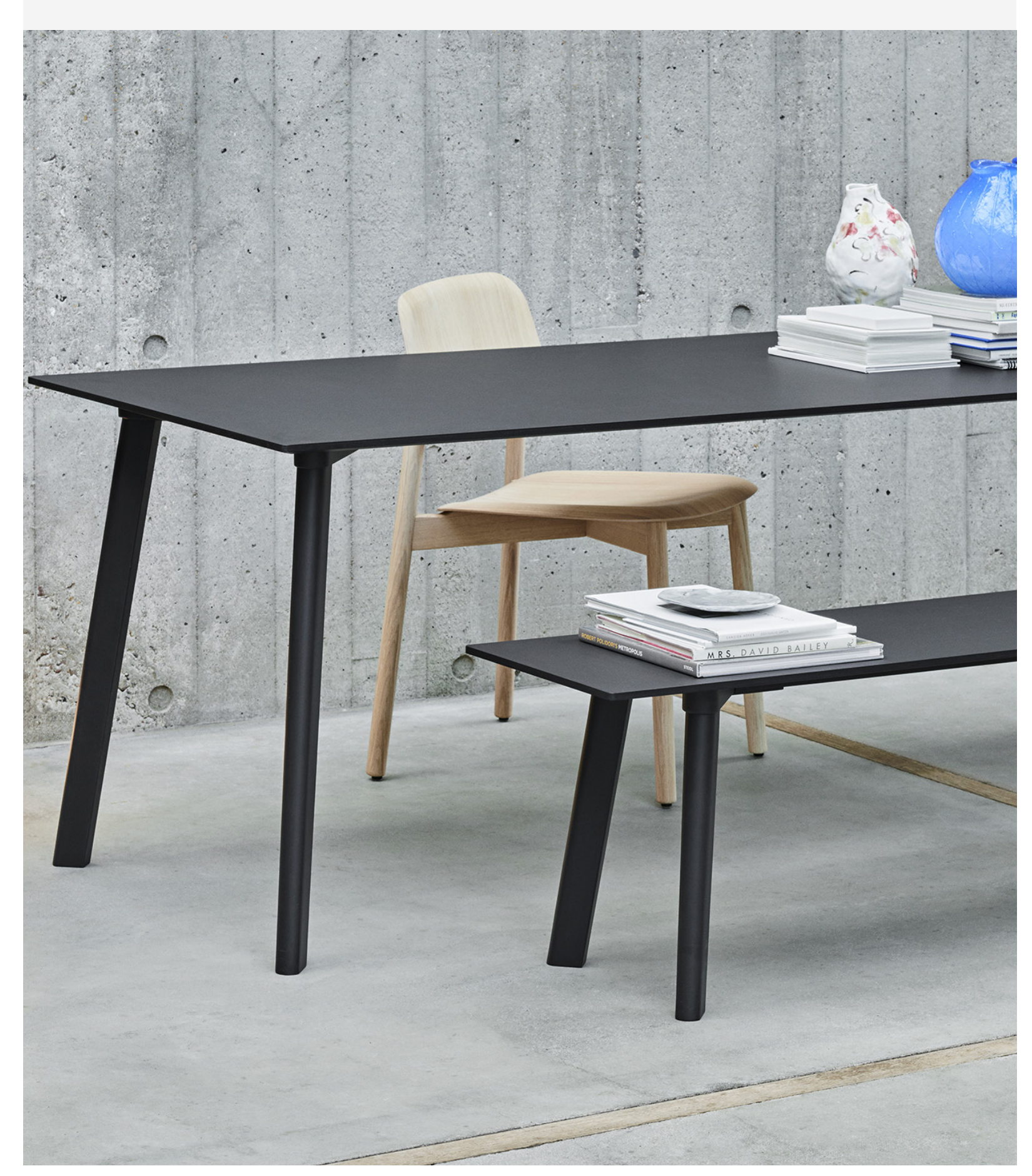
CPH Deux 210 Table | Ink black laminate tabletop | Ink black beech base

CPH Deux 210 Table | Pearl white laminate tabletop | Pearl white beech base