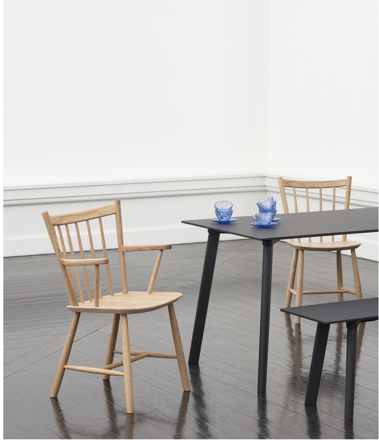
CPH Deux 210 Table | Ink black laminate tabletop | Ink black beech base

CPH DEUX 210 TABLE Length 200 cm Width 75 cm Height 73 cm