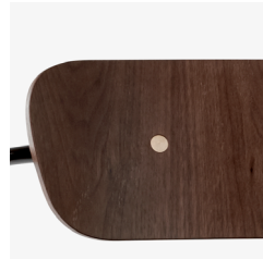
Lacquered walnut with brass fitting