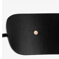
Black lacquered oak with brass fitting