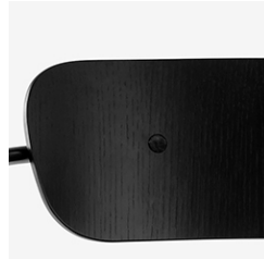
Black lacquered oak with black fitting