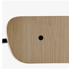
Lacquered oak with black fitting