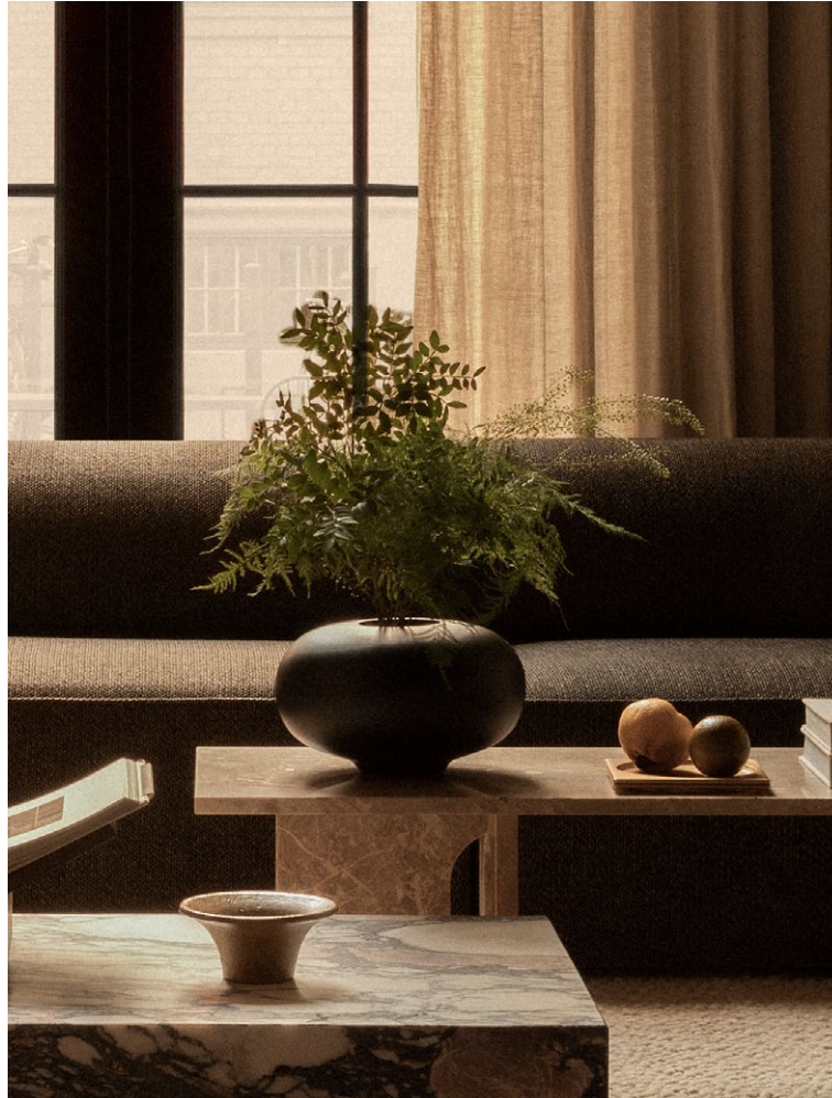
SURROUND VASE Designed by Colin King Studio