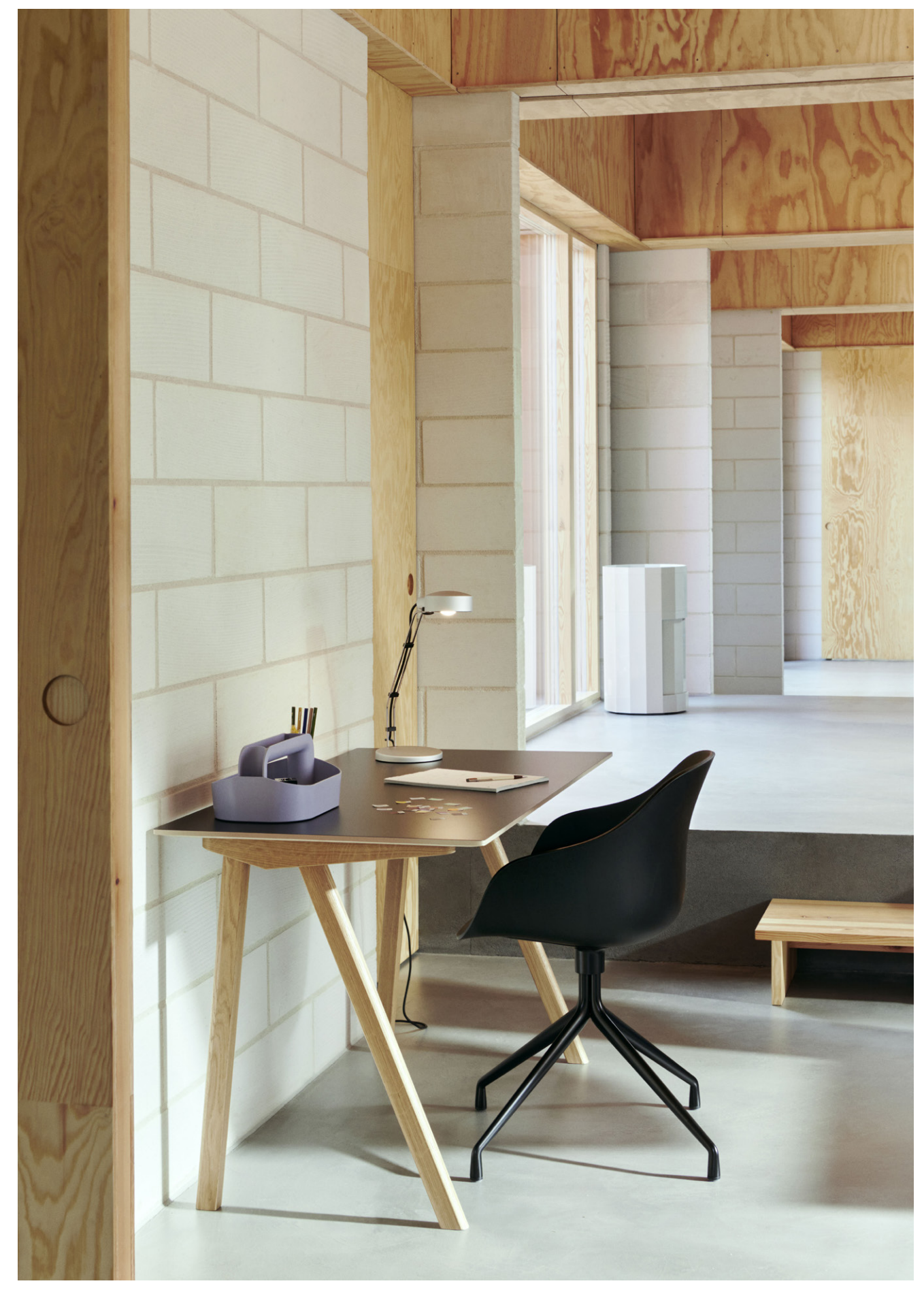
CPH 90 Desk | Black laminate tabletop | Oak frame

The CPH90 brings classic desk aesthetics into a modern context. The Bouroullec brothers' simple yet graceful asymmetrical legs coupled with the streamlined tabletop results in a functional, compact, and uncluttered design. It is available with tabletops and frames in a variety of wood types and materials, with the possibility to select matching or contrasting combinations. The Copenhague Desk's versatile and elegant design makes it suited to a variety of corporate environments, as well ideal for working at home.