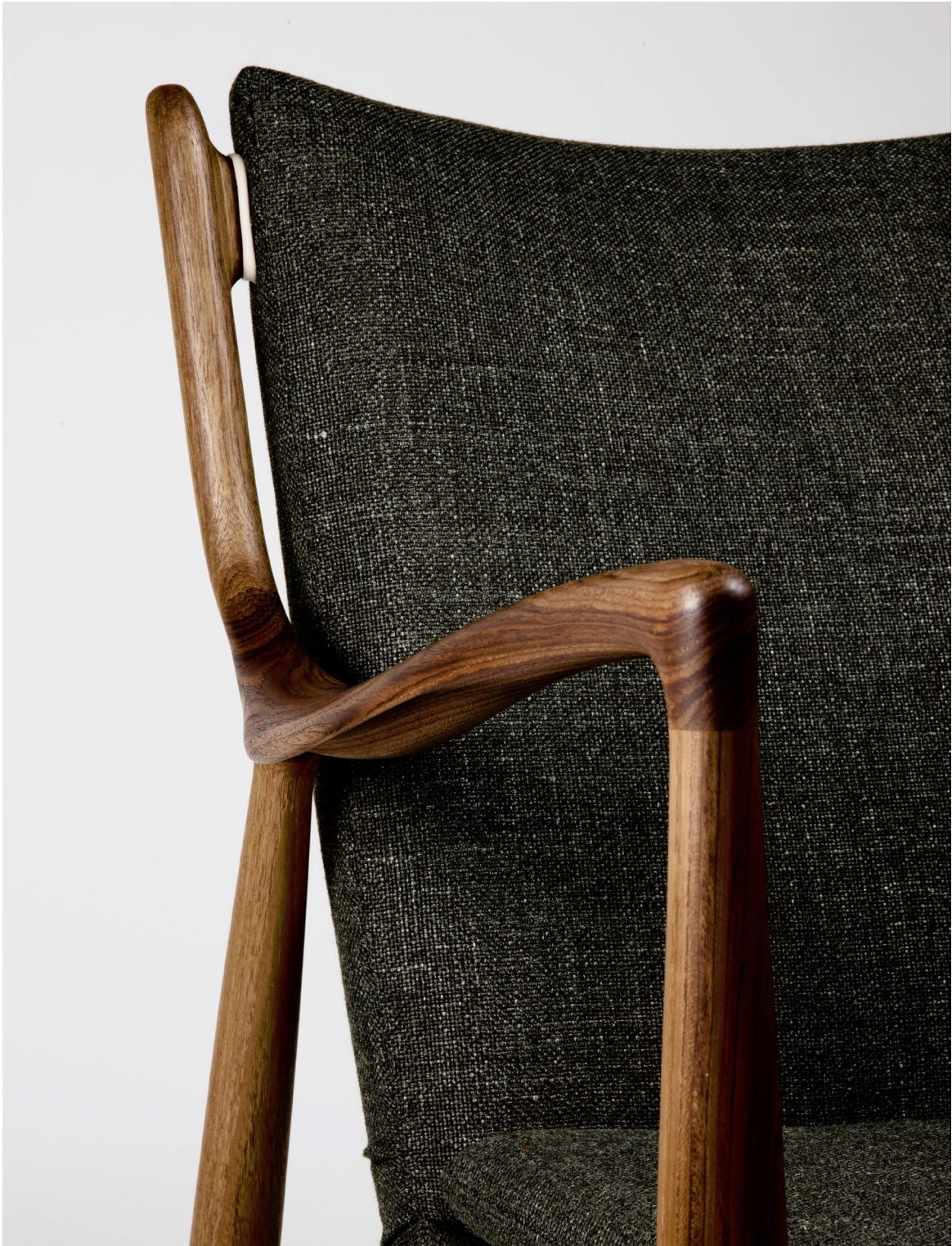
45 CHAIR 1945 BY FINN JUHL