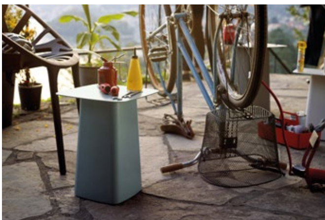
Metal Side Table (Outdoor)

Metal Side Tables are available in a weatherproof, powder-coated version with a fine-textured finish. The tables make a perfect companion for the indoor-outdoor Waver armchair, whose bases come in matching colours.