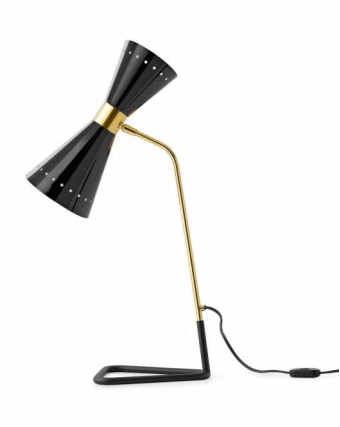
Table Lamps | 220-240 V | 2xE14 9574