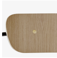
Lacquered oak with brass fitting