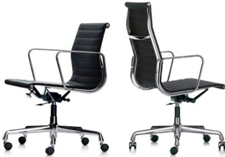
EA 117, EA 119

The chairs in the Aluminium Group are the best known design by Charles and Ray Eames. The chairs were created in 1958 and are now a classic in the history of 20th century design.