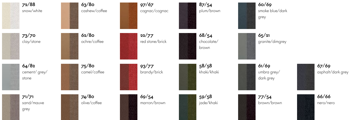
Leather Premium/back panel Plano