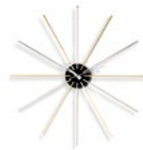
Star Clock, chrome/brass, Ø 610