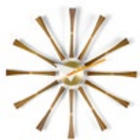
Spindle Clock, aluminium, solid walnut, Ø 577