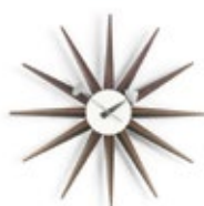
Sunburst Clock, walnut, Ø 470