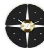
Petal Clock, black/brass, Ø 448