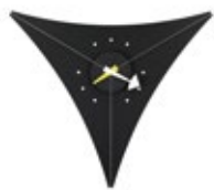
Triangle Clock, polystyrene, 520 x 450 mm