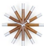
Wheel Clock, walnut/aluminium, Ø 455