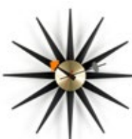
Sunburst Clock, black/brass, Ø 470