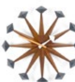
Polygon Clock, walnut, Ø 430