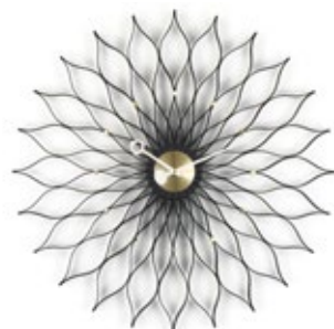
Sunflower Clock, black ash/brass, Ø 750