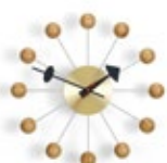
Ball Clock, cherry, Ø 330