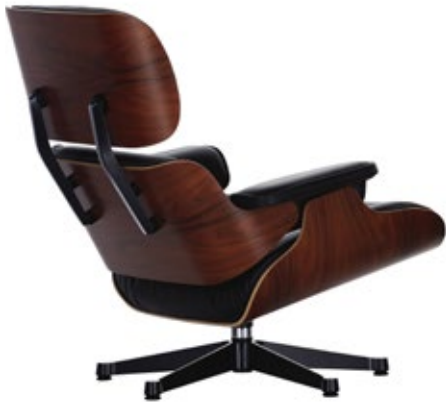
Lounge Chair (classic version)