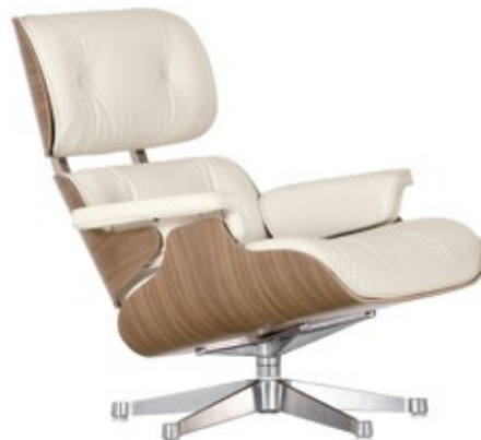
Lounge Chair (white version)