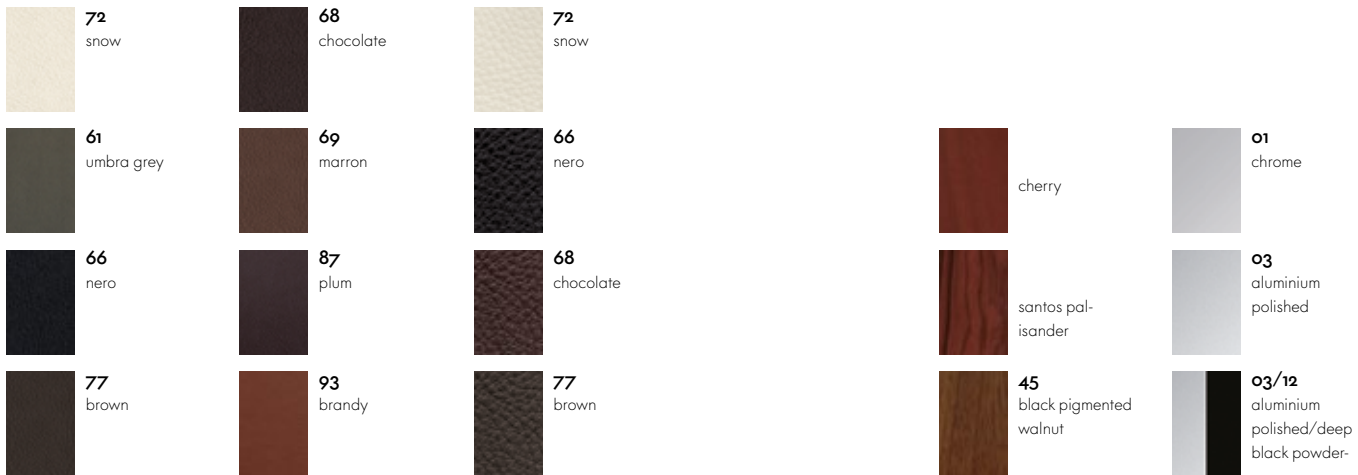
Leather Premium (Lounge Chair classic version)