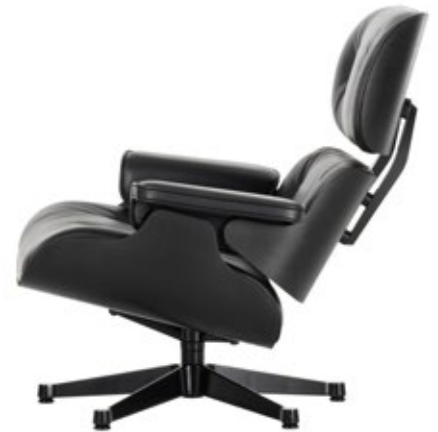
Lounge Chair (black version)

‘Why don’t we make an updated version of the old English club chair?’ With this comment, Charles Eames initiated the development of the Lounge Chair, a process that took several years. The aim was to satisfy the desire for an amply proportioned chair that combined ultimate comfort with the highest quality materials and craftsmanship. When it came out in 1956, the design of this armchair by Charles and Ray Eames set new standards: it is not only lighter, more elegant and more modern than the conventionally ponderous club chair – it is also more comfortable. Thanks to these qualities, the Lounge Chair became one of the most famous designs of Charles and Ray Eames and has attained the status of a classic in the history of modern furniture.