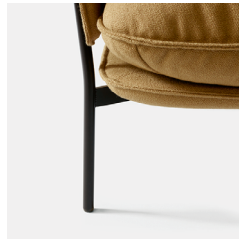
Warm black powder coating