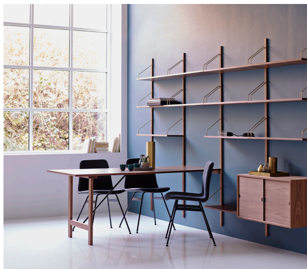
Table (L) H72 or 109 cm., 80 x 175 cm.

For more information and pictures, please visit www.dk3.dk under "press / downloads" or contact us at info@dk3.dk / tel. 0045 7070 2170.