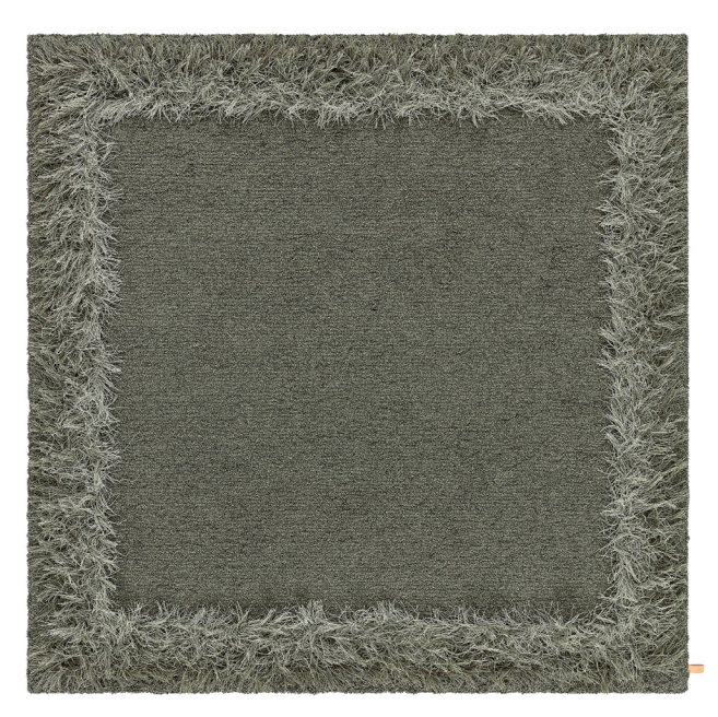
Rug 240x240 cm, Nandu 500