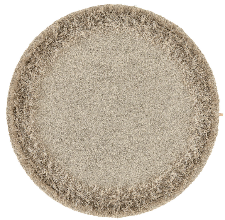
Rug round: Ø 240 cm, Heron 800