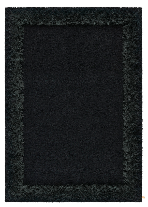
Rug 170x240 cm, Raven 502