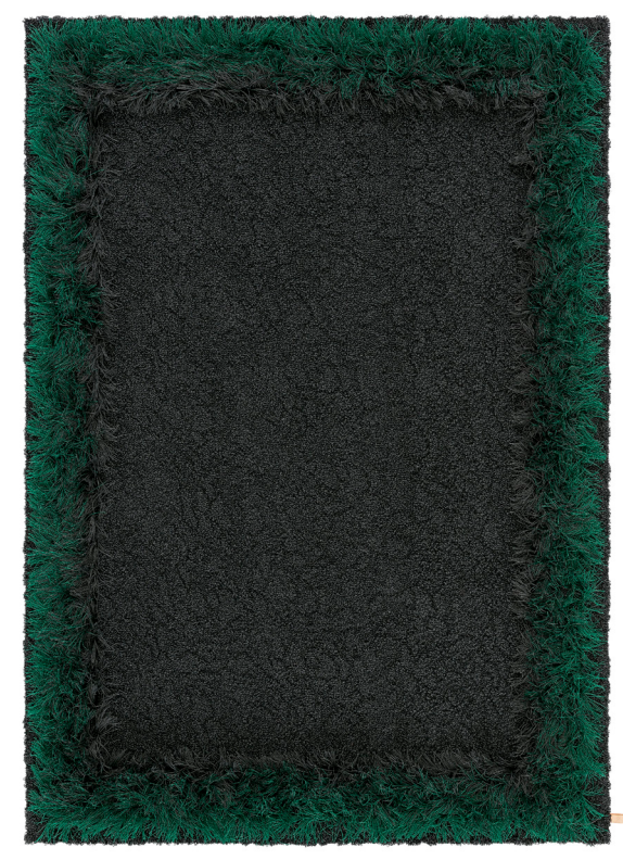
Rug 170x240 cm, Peacoock 501