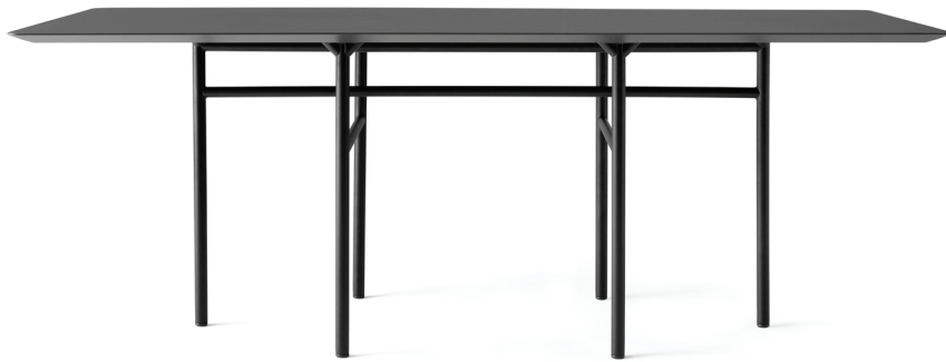
Black / Charcoal 1180539