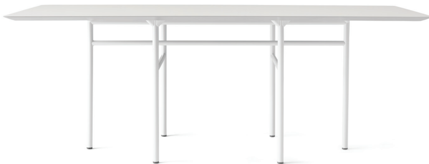
Light Grey / Mushroom 1150689