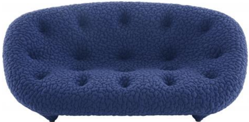
SMALL SETTEE HIGH BACK