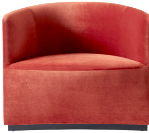
City Velvet CA7832/062