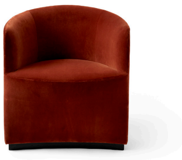
City Velvet CA7832/062 9600259

Upholdstered PC1T 9600001 PC2T 9600002 PC3T 9600003