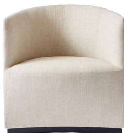
Savanna 202 9600029