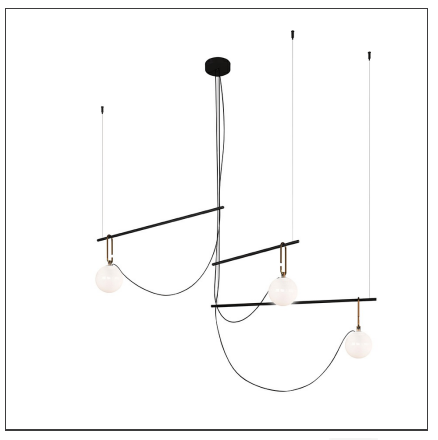
IP20 □ 🖟 c€ Dimmerable: +①-