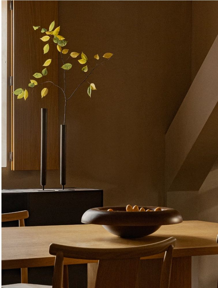
ROND BOWL Designed by Colin King Studio