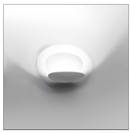
IP 20 (€) (€) Dimmerable: +() -