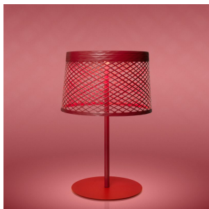
Twiggy Grid XL